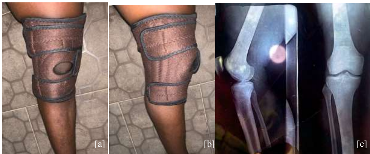
Figure 3: Conservative management of a 1 year post-traumatic right recurrent lateral patella dislocation in a 24 year old male patient. Use of knee brace (3a); Patient's radiograph was essentially normal (3b)