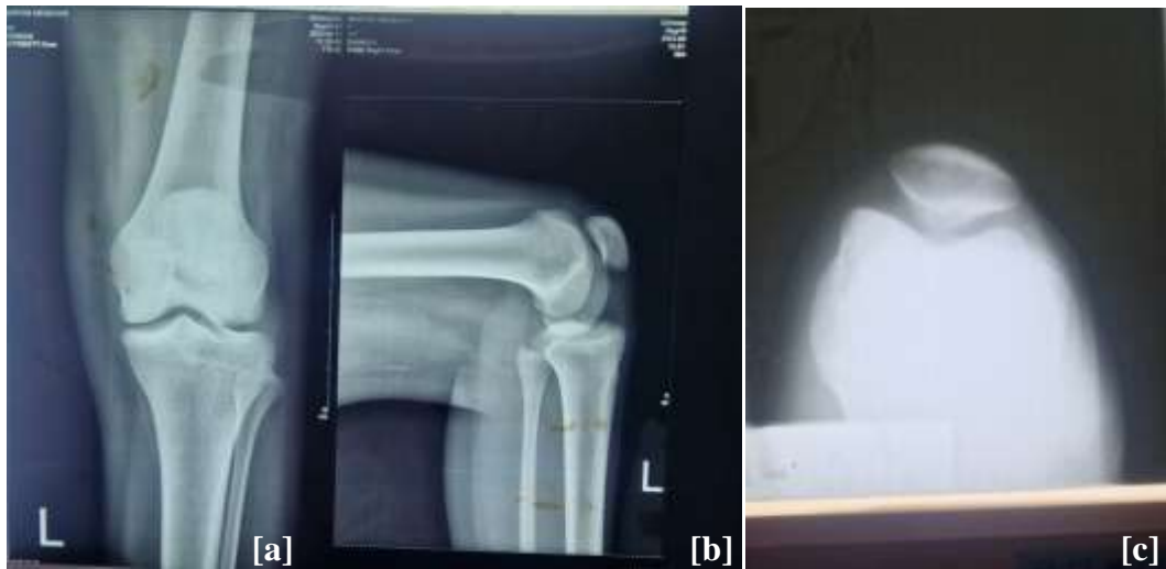
Figure 2: Preoperative radiograph of a 27 year female patient. Antero-posterior view(2a) and Sunrise view (2b)

yrs=years, +=present, -=absent, LFU=lost to follow-up