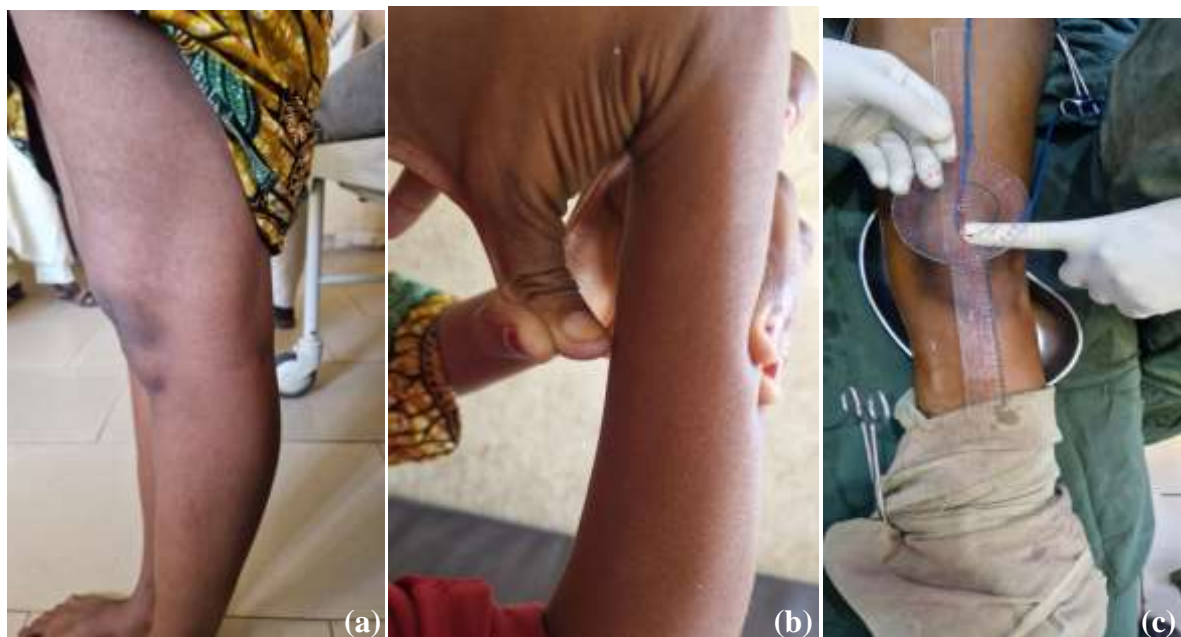
Figure 1: Assessment of generalised ligament laxity in a 27 year old female patient (Figure 1a & 1b); Measurement of Q Angle (Figure 1c).

The radiograph was requested for to assess the trochlear morphology (groove and depth) (Figure 2b), the Caton-Deschamps index [18], and any degenerative changes (Figure 2a). The preoperative Kujala et al. score [19] and Lysholm score [20] were also assessed on every patient. The cardiovascular and other systemic examinations were carried out for further patients evaluation and general condition.