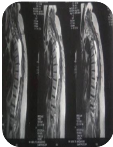
Figure 1: Coronal T1 gado section on the right, showing thoracic extension exerting a mass effect on the spinal column and its