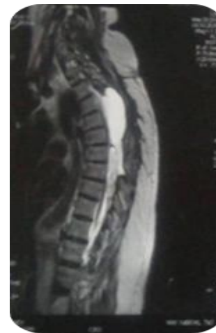
Figure 4: appearance of the white hydatid vertebra

red colour [5]. Sequestrations form, while the trabecular structure of the vertebra has disappeared. All this intraosseous proliferation is insidious and painless, which explains the clinical latency frequently observed. On the other hand, the intra-spinal spaces where the larva develops are the same as in visceral forms, and the symptoms are more obvious because of the damage to the nervous system. Advanced spinal lesions give the appearance of a white hydatid vertebra (Figure 4).