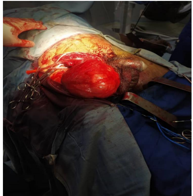
Figure 3: Testicular mass

With continuous surgery to check testis we find a testicular mass that pulled intestine into the scrotum (figure3)