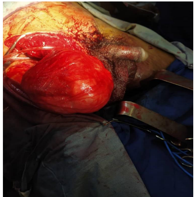
Figure 3: Testicular Mass

We did Radical orchiectomy by inguinal approach and replace intestine in abdomen and repair inguinal hole by tissue flap. After 2 days patient has defecation and we discharge him healthy and successfully.