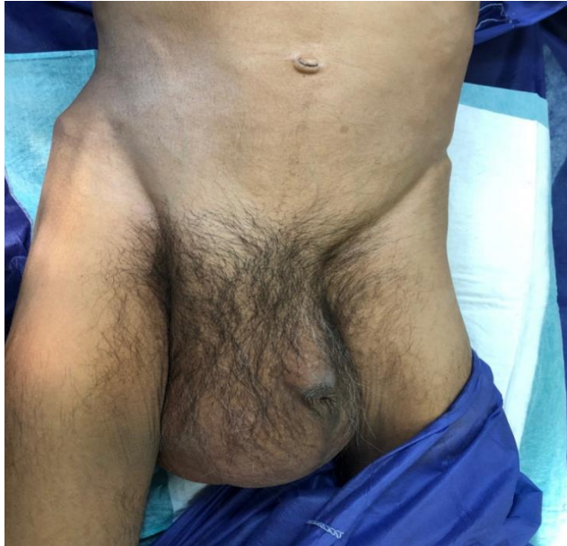
Figure1: Huge scrotum

Our case was a 90 years old man that referred to surgery part with abdominal pain, we admit him and start examination, we find huge scrotum that was carried for 2 days (Figure 1)